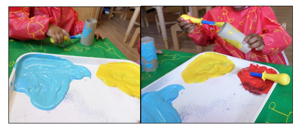
Continuing the theme of world music our toddlers made their very own musical instruments from old toilet roll tubes!

number of sides of some shapes as well as counting the number of identical shapes and grouping them accordingly. They also discussed the different colours of the shapes.